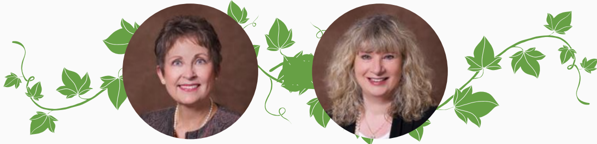
MAYOR BECKY SHEVLIN

The City Council is a legislative body of the city formed to represent all residents living in Monrovia, keeping all of your interests and opinions in mind during decision-making processes! Get to know the Monrovia City Council by clicking here!