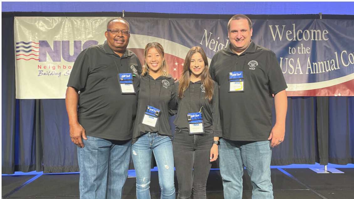
Monrovia Area Partnership Best Neighborhood Program Award Finalist

for the Best Neighborhood Program award for our virtual MAP Neighborhood Conference that took place in 2021! The MAP team presented to a panel of judges on our 11th Annual VIRTUAL MAP Neighborhood Conference in hopes to inspire other cities and organizations, and to show how our team adapted in the heat of the pandemic. We attend the NUSA Conference yearly in hopes to learn about the various events and programs that other cities around the country have, so that we can implement new ideas to make our MAP programs and events better for our community. Fun fact, most of MAP's current programs and events came from previous NUSA Conferences. :)